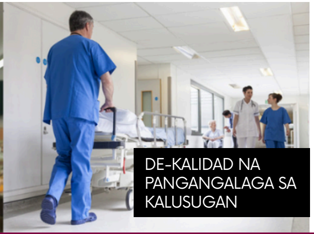
DE-KALIDAD NA PANGANGALAGA SA KALUSUGAN

Ang diskriminasyon sa pabahay ay maaaring tanggihan ka ng maraming pagkakataon.