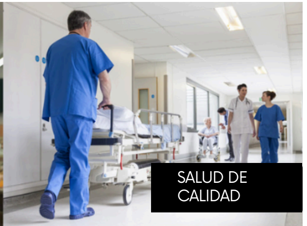
SALUD DE CALIDAD

La discriminación en la vivienda puede negarte muchas oportunidades.