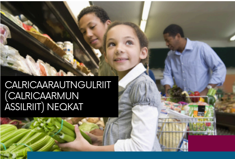
CALRICAARUTNGULRIIT (CALRICAARMUN ASSILRIIT) NEQKAT