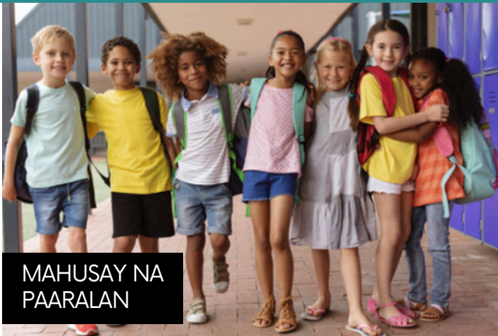
MAHUSAY NA PAARALAN

Ang diskriminasyon sa pabahay ay maaaring tanggihan ka ng maraming pagkakataon.