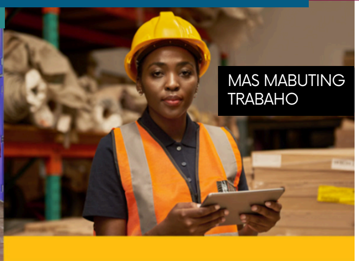
MAS MABUTING TRABAHO

Ang iyong lahi ay hindi dapat makaapekto sa iyong tahanan, iyong kalusugan, iyong mga anak, o iyong trabaho. Sa ilalim ng Fair Housing Act, ILEGAL para sa mga may-ari at mga ahente ng lupa at bahay na tumanggi na magparenta o bumili ng bahay dahil sa iyong lahi. Kung naniniwala kang nalabag ang iyong mga karapatan, magsampa ng reklamo. Karapat-dapat tayong lahat na manirahan sa ligtas na pabahay na may makukunan sa mga pagkakataon.