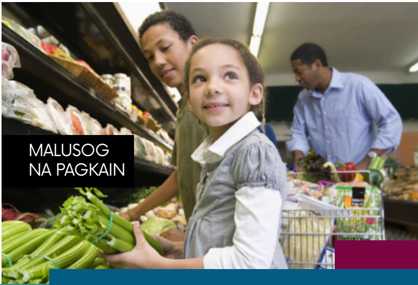
MALUSOG NA PAGKAIN